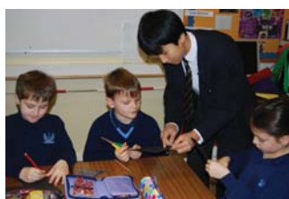
The photos show two of our pupils from abroad practising their language skills and testing out giving instructions on Year 3 pupils. They quickly learn to become fluent.