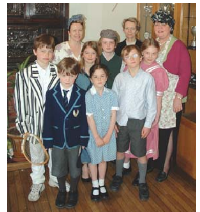
Staff joined in on Dressing-up day