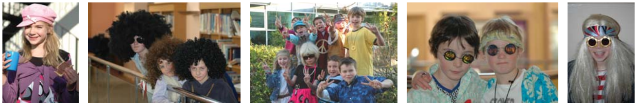
1960s Dressing-up day

A special mug celebrated the anniversary