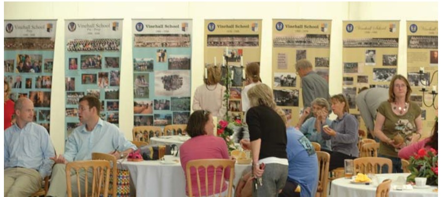
Visitors to the exhibition of Vinehall Past and Present on Vines' Day