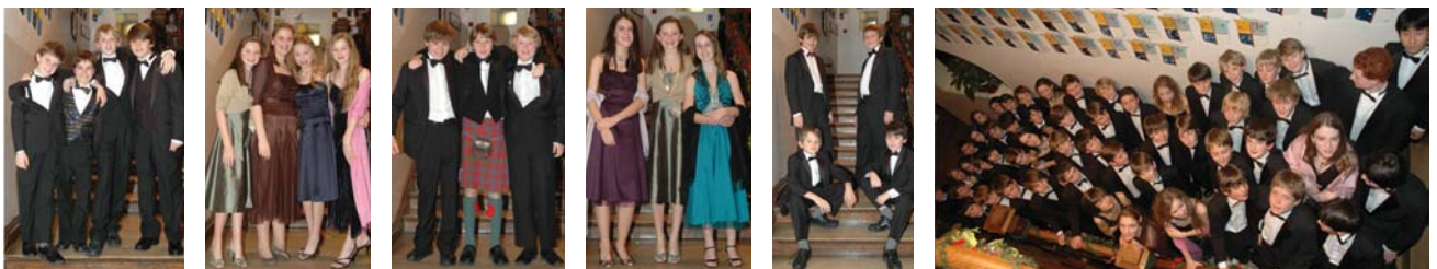
Today's Year 8 pupils smartly dressed for the Christmas Dinner and Dance