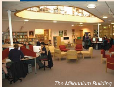
The Millennium Building