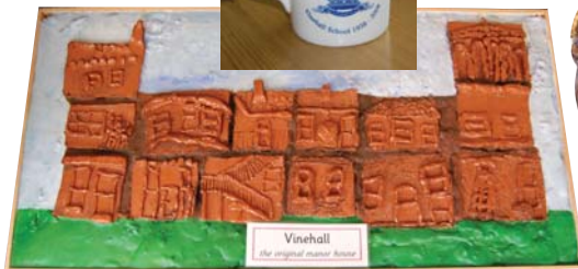
Pre-Prep children worked together to make a ceramic relief of some of the Vinehall buildings