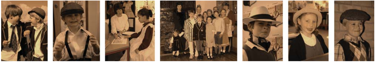
1938 Dressing-up day

The children have celebrated our anniversary in some wonderfully varied ways.