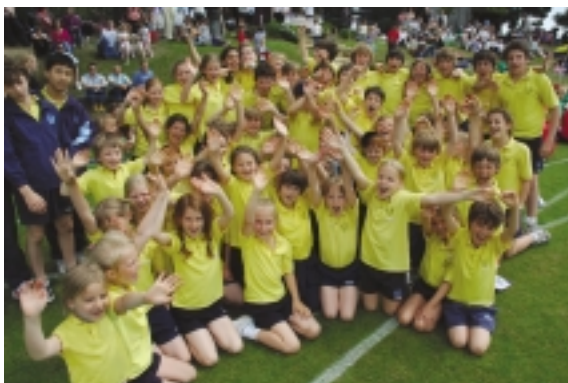
Saxton - House Winners on Sports Day