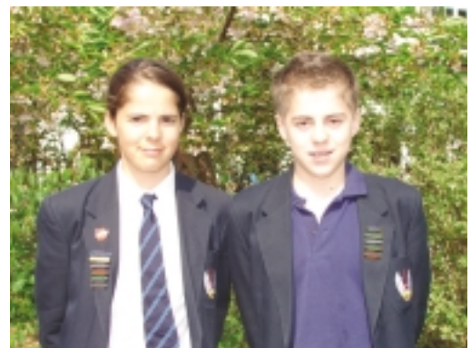
Captains of Swimming