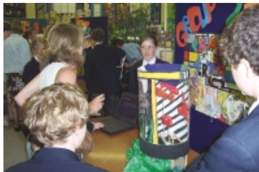
A display of creative work in the Front Hall