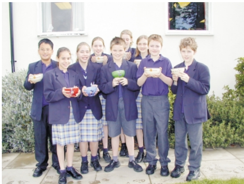
French Competition Winners